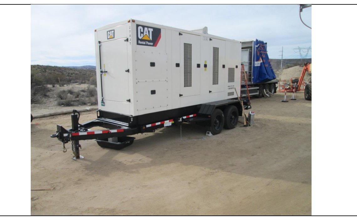
Photo 4: In accordance with MM-HAZ-1a, spill prevention countermeasures were observed in place, consisting of containment bins below temporary generators.

Photo 3: FAA marker balls were observed being attached to the 138 kV line at select locations to meet FAA requirements and MM-TRA-3.