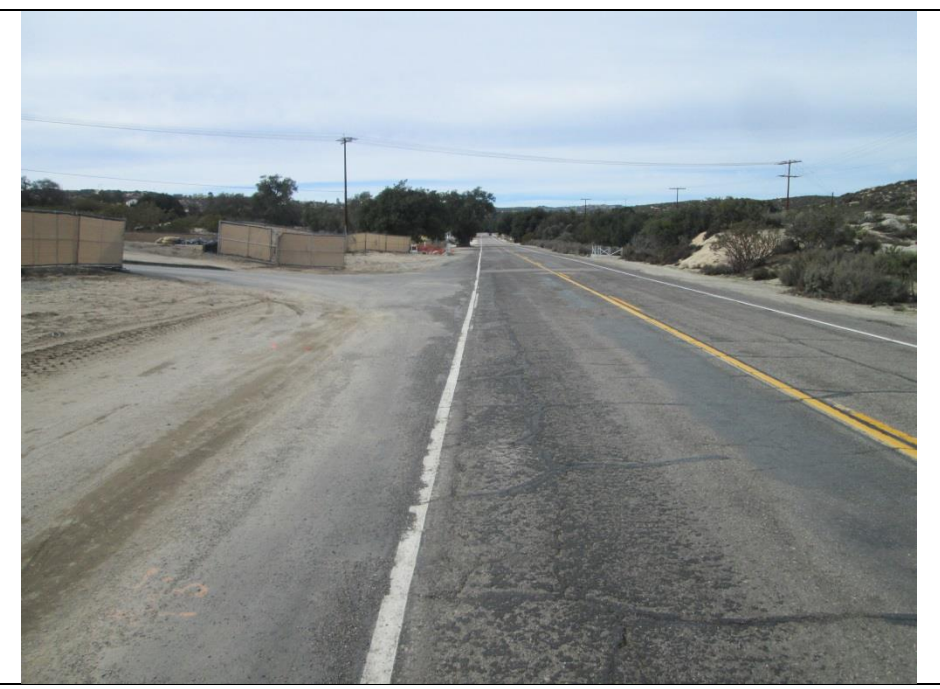
Photo 6: Old Highway 80 was observed being swept on a regular basis in accordance with MM-BIO-4a.

Photo 5 : A detention basin has been constructed at the Boulevard Substation Rebuild to dissipate stormwater flows during a rain event.