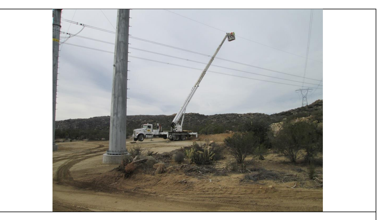
Photo 3: FAA marker balls were observed being attached to the 138 kV line at select locations to meet FAA requirements and MM-TRA-3.