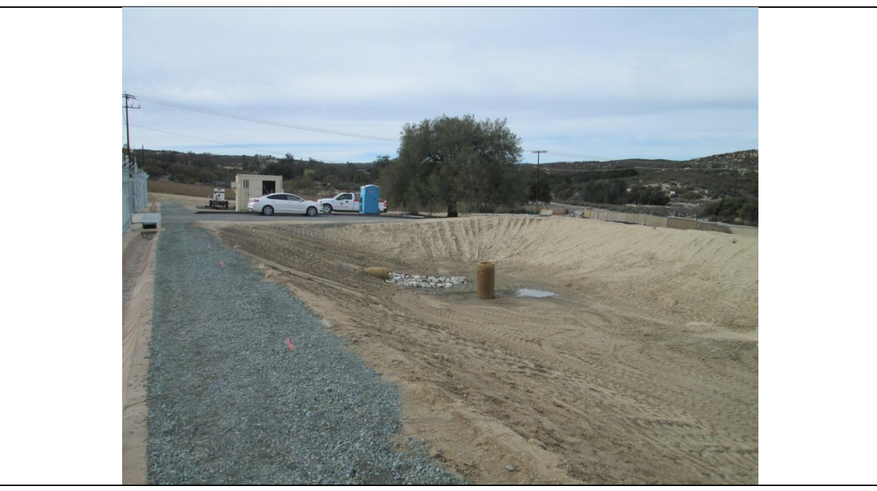
Photo 5 : A detention basin has been constructed at the Boulevard Substation Rebuild to dissipate stormwater flows during a rain event.